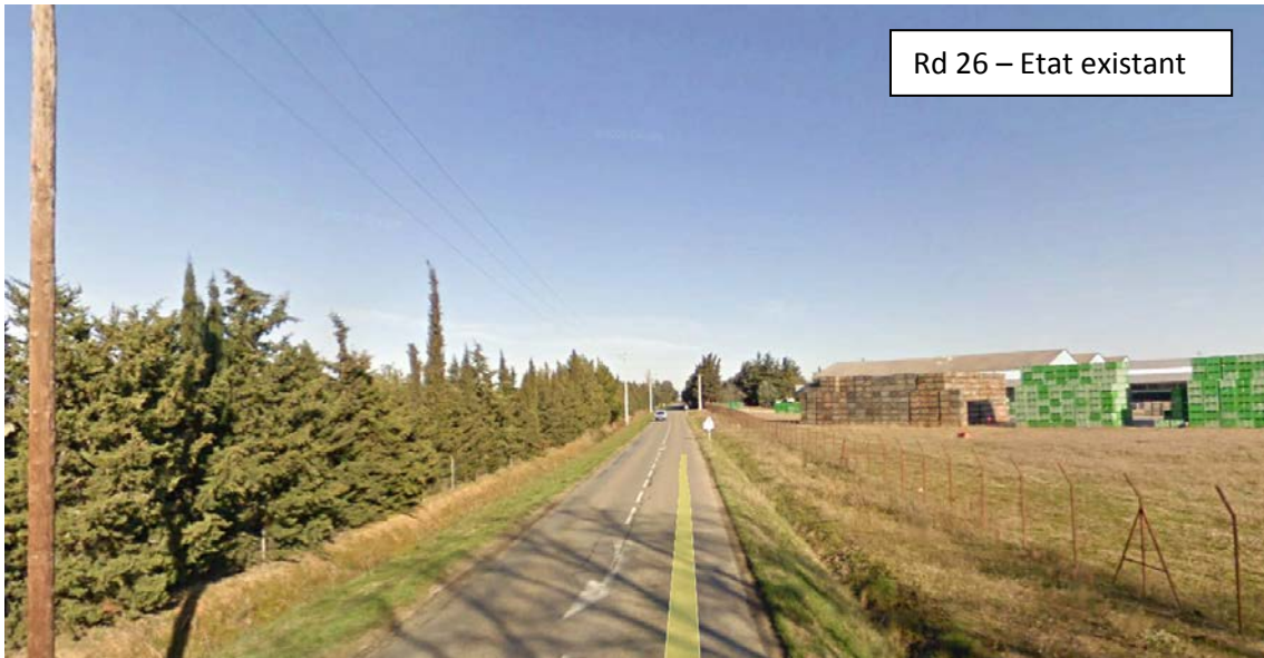
Rd 26 – Etat existant