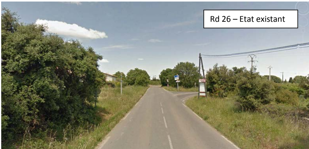
Rd 26 – Etat existant